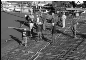
Carpenters placing concrete at Downtown Parking Garage Coogan construction

The question on everyone's mind is what's coming up. Without a crystal ball I find it hard to answer. But one thing that is coming up and will benefit all members are the Skill Enhancement classes. More and more contractors from across the country are bidding on work in Southeast and many of these contractors are requiring several certifications to be held by the member before they