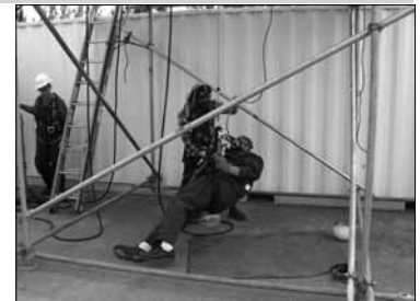
(Left) Rescuing entrant is lowered in suspension into the IDLH situation for rescue. (Middle) Getting a person stabilized and controlling their free motions during their suspension, (Right) they still need to get him through the hole, get him released, stabilized, disconnected, and out of the way.

Note: The Millwright Training Center in Kenai has temporarily suspended training until after the holidays.