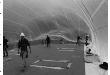
Carpenters working on the Juneau City Shop-North Pacific Erectors

Here is to another prosperous year in Southeast Alaska!